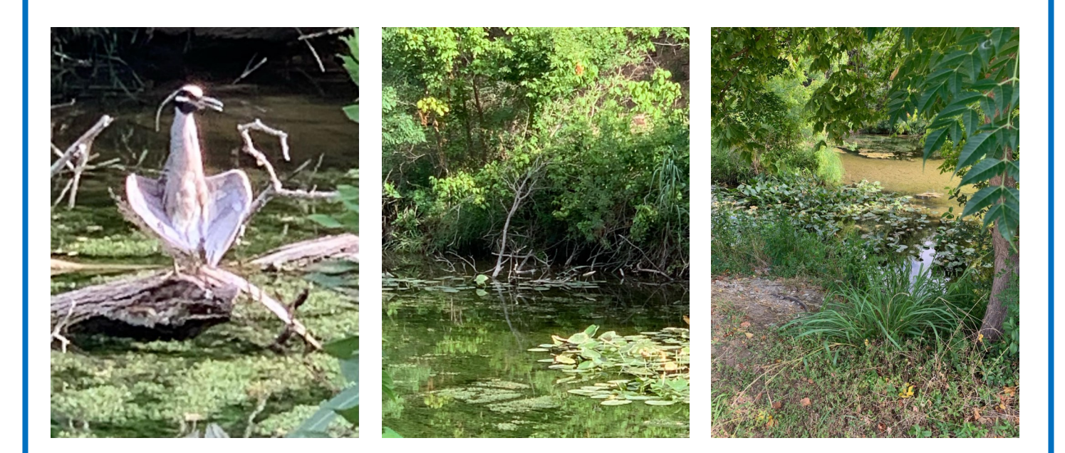
Last outdoor gathering for July & August

Walk-n-Talk has continued to meet at the Georgetown Rec Center to walk the track on the 2nd floor. Too hot to walk outside for a while yet!