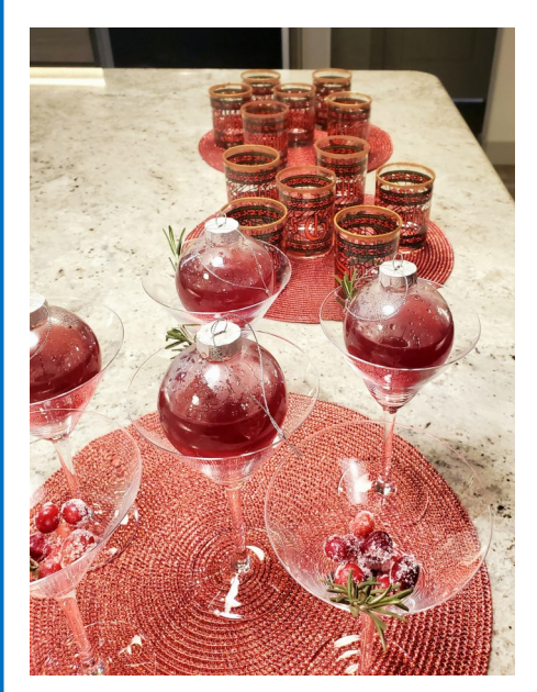
Very Merry Martinis