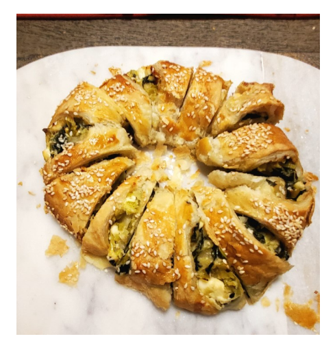
Spinach & feta wreath