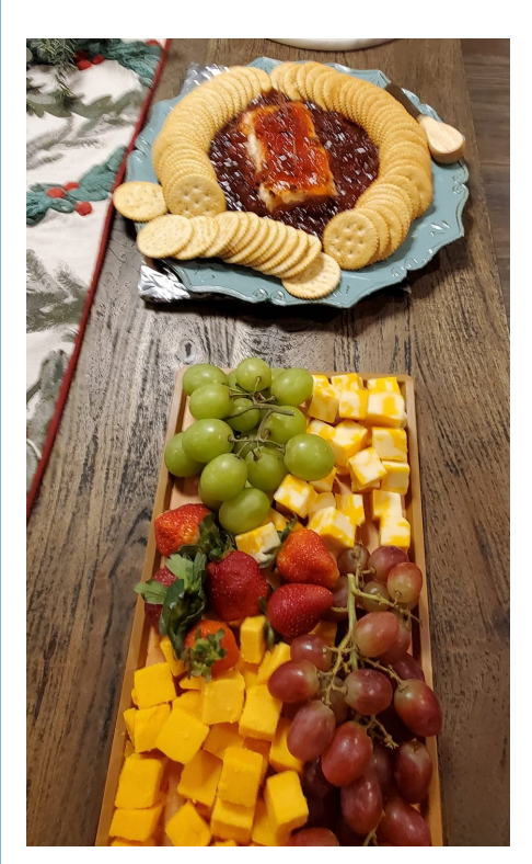
Fruit & cheese plate Strawberry jalapeno jelly over cream cheese