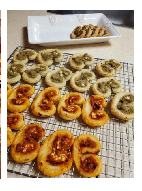
Sun-dried tomato & broccoli pesto palmiers