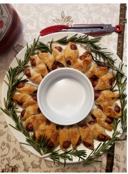
December hosted by Pat Butterfield, and featuring a selection of Bogle wines Lots of yummy food and holiday cheer!