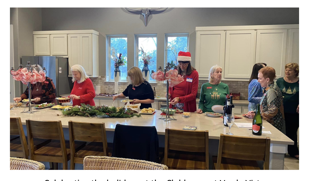
Celebrating the holidays at the Clubhouse at Verde Vista