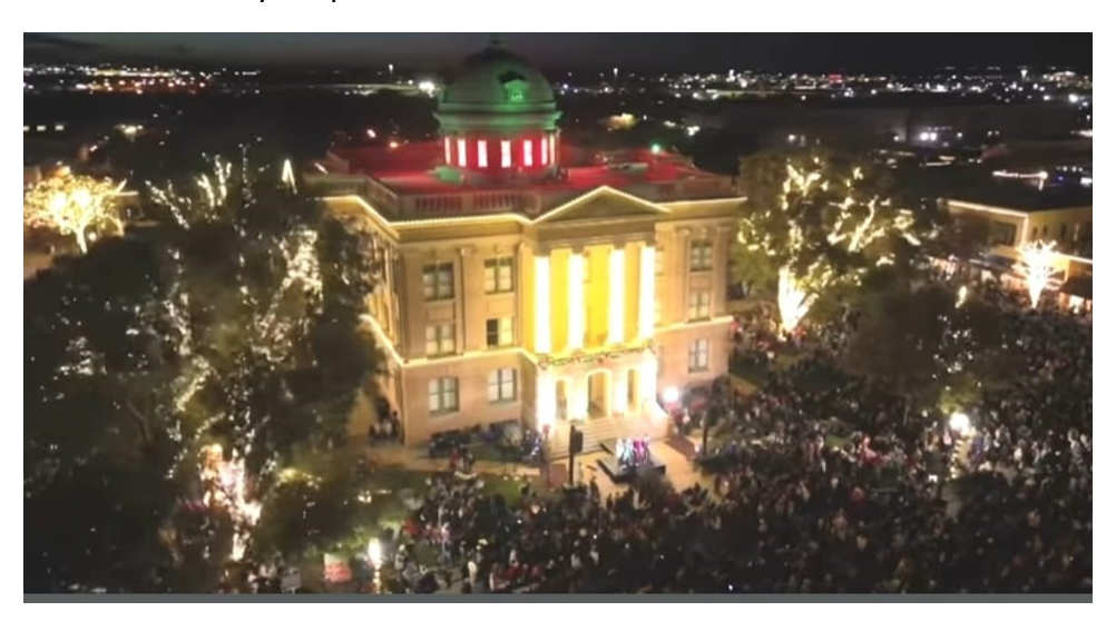
Georgetown Newcomers and Friends